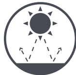
UV RESISTANT (INSIDE USAGE)