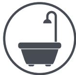
SUITABLE FOR WETROOMS