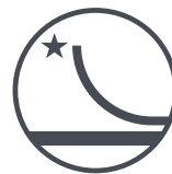
EXCELLENT INTERNAL BONDING