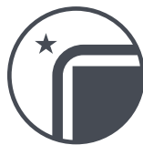
EXCELLENT WRAPPING QUALITY